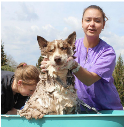
Pamper Your Pooch

Christmas Giving Tree at Gwinnett Animal Hospital (December 2016)