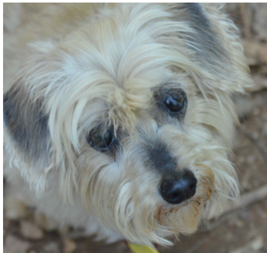
Beautiful Trudy was also adopted in 2016