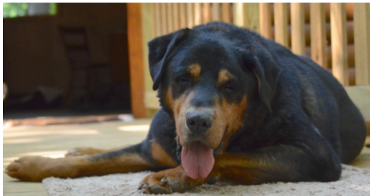
Huxley and Cody also passed over the Rainbow Bridge in 2016