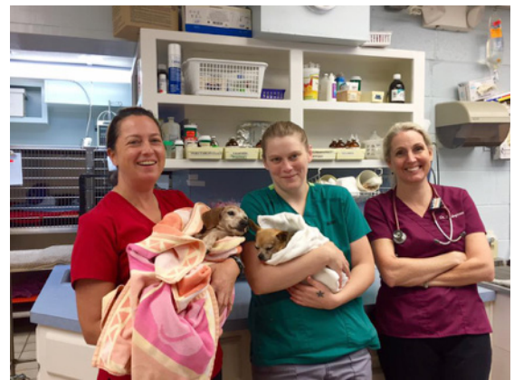
Our friends at Gwinnett Animal Hospital looking after our sugar snouts